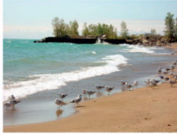
Gathering on 12th Street Beach

Experience an event where the power of Human Kindness comes together as "One Community" to celebrate the extraordinary gift of Water, which is essential to our existence. This will be a celebration that bridges the business, faith, government, medical, education, recreational, and all public communities, while creating an awareness of the important connection water has on our environment and daily lives.