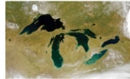
Our Great Lakes

The Great Lakes supply 95% of the fresh water consumed and used for the entire United States and is 20% of the Entire Planet's fresh water resource. The Great Lakes and their connecting channels form the largest fresh surface water system on the earth.