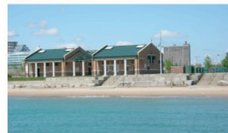
12th Street Beach Pavilion